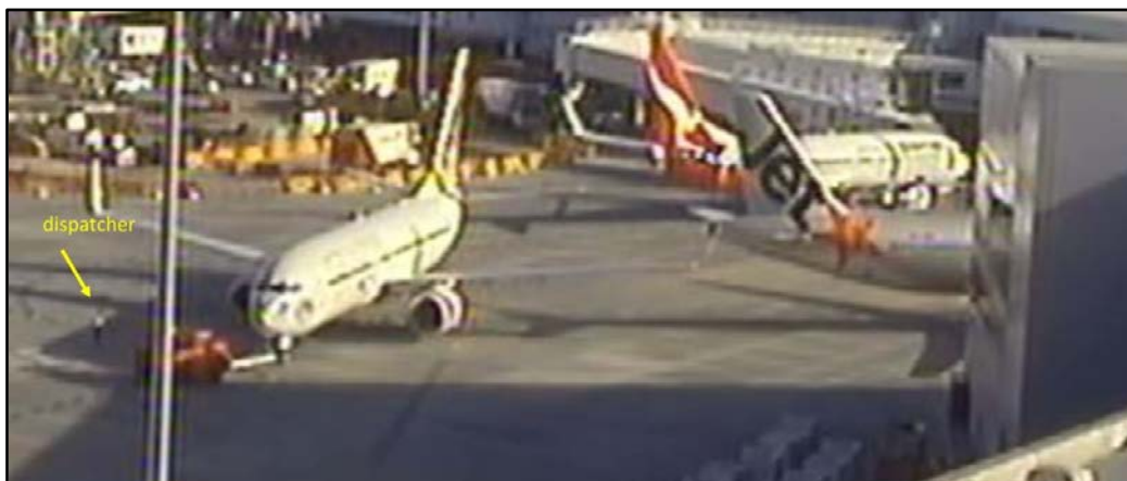
Figure 4: Screenshot of YID during pushback, 5 seconds before the collision with VGR and showing the position of the tug and the dispatcher