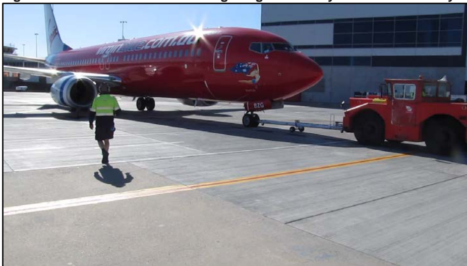
Figure 5: Pushback of the same Virgin flight from bay E1 on the next day