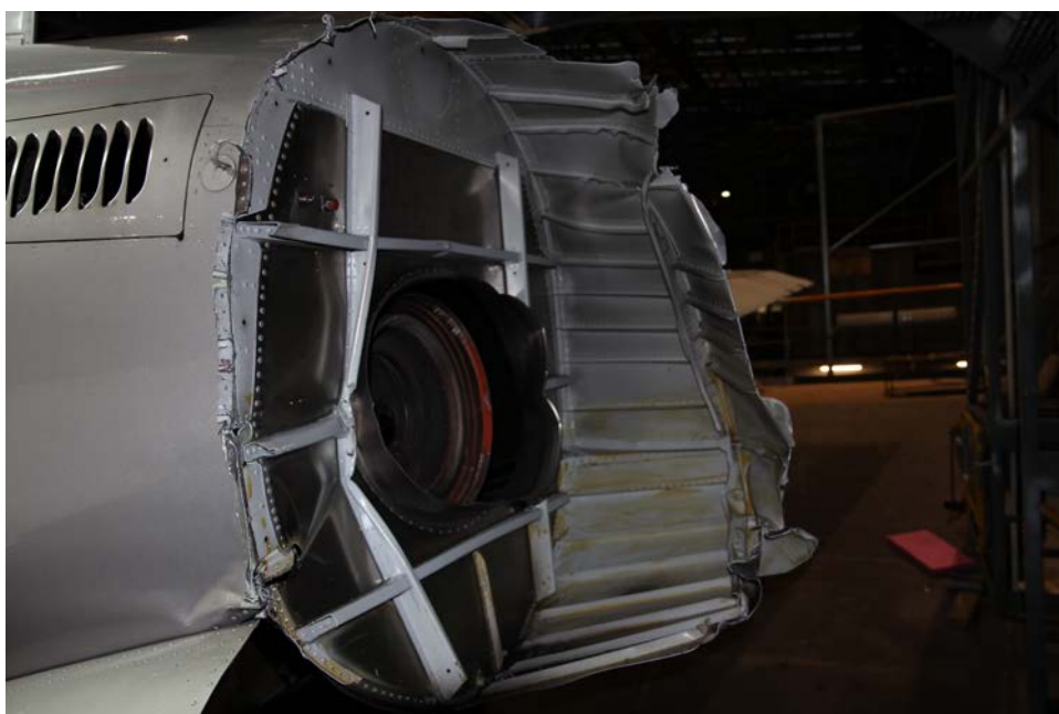
Figure 3: Damage to the tail cone of VGR aft of the APU, looking from left to right of the aircraft

The tail cone of VGR aft of the auxiliary power unit (APU) and the APU exhaust duct separated from the aircraft (Figure 3). The bulkhead aft of the APU was buckled and there was also minor localised damage to the external skin.