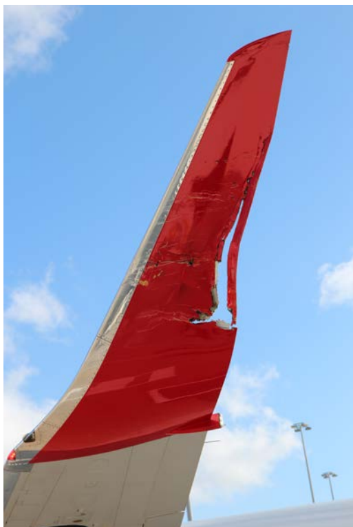
Figure 2: Damage to the left wingtip of YID